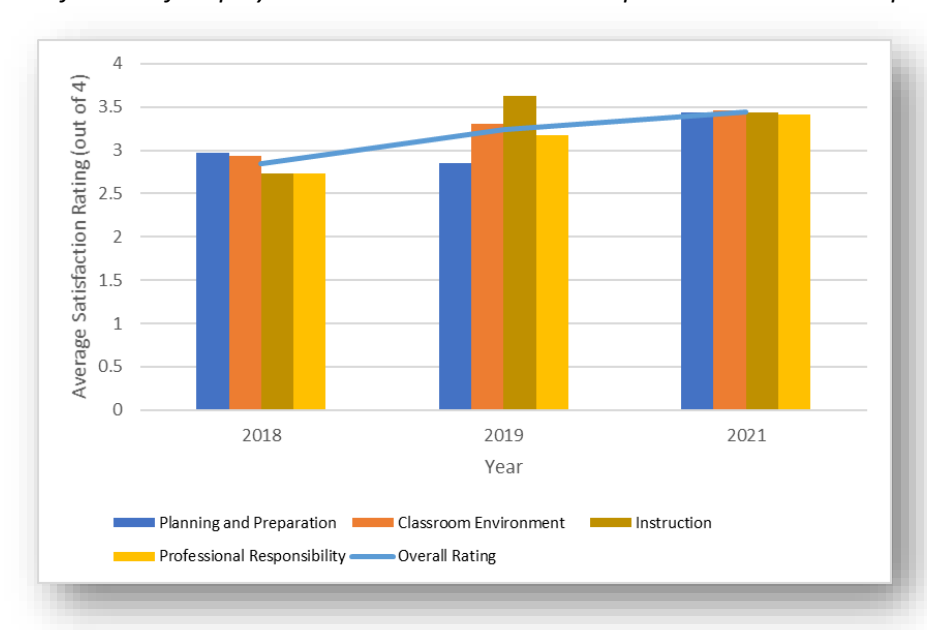
Figure 2.1 Satisfaction of employers towards UAEU-CEDU completers' relevance and preparation

Note. No survey was conducted in 2020 due to the pandemic; Data cannot be disaggregated due to the limited completer information provided by the data source.