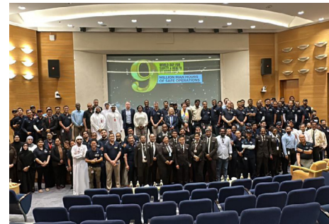
Group photo during the Celebration