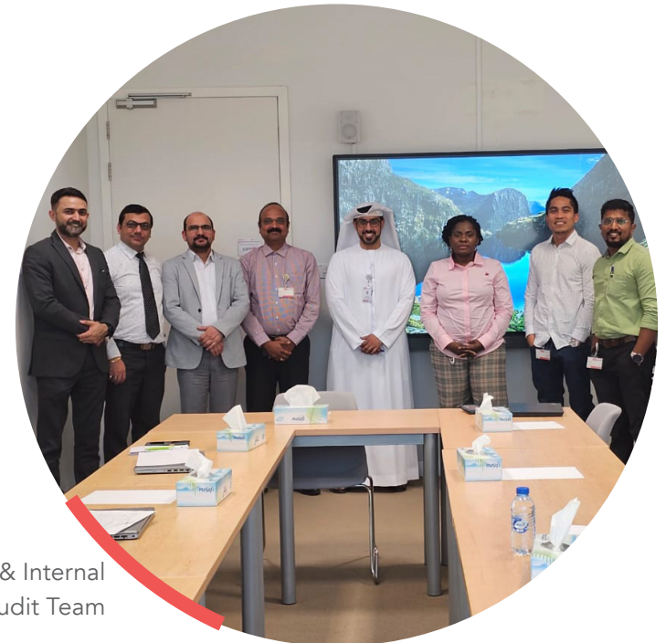
External & Internal Audit Team