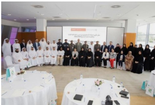
Faculty of Administration and Economics Honours its strategic partners who contribute to training students for 2022/2023 academic year

Program is designed to inform students about OHS requirements within UAEU and requirements in the workplace once graduated. Student also assist the section by studying challenge(s) within O&ES, recommend solution(s) to improve OHS performance.