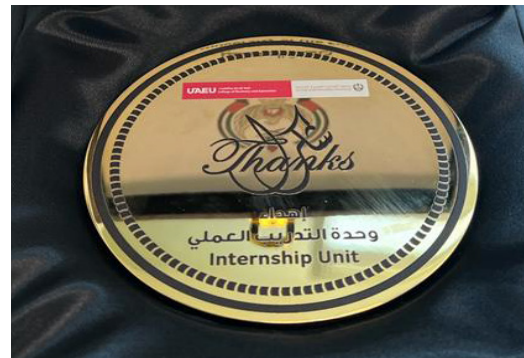
Plaque & Certificate of achievement/ appreciation was presented to FMD department and staff

AMONG THE RESULTS OF THIS COOPERATION, 4 SECTIONS OF TRAINING COMPLETED, BENEFITING 9 STAKEHOLDERS FROM UAE UNIVERSITY, COLLEGE OF BUSINESS & ECONOMICS AND ABU DHABI VOCATIONAL EDUCATION AND TRAINING INSTITUTE (ADVETI).