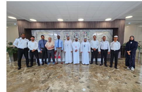
Joint cooperation with Abu Dhabi police to promote "We are all police" initiative in UAEU Campus