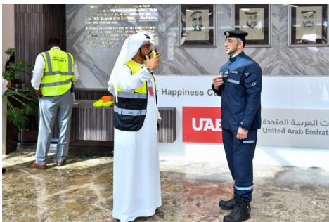
Civil Defence as observer during Fire Drill at Crescent Building

O&ES and FMDHS Joined Khadamat team World Safety & Health Campaign. Campaign was aimed to share progress made to ensure a safe and healthy workplace. This was an excellent opportunity to present UAEU OHS Initiative Achievement July – Dec 2022