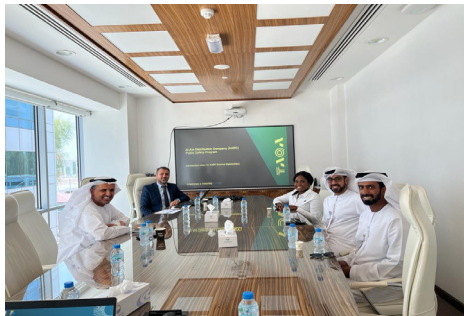
Meeting with Al Ain Distribution company